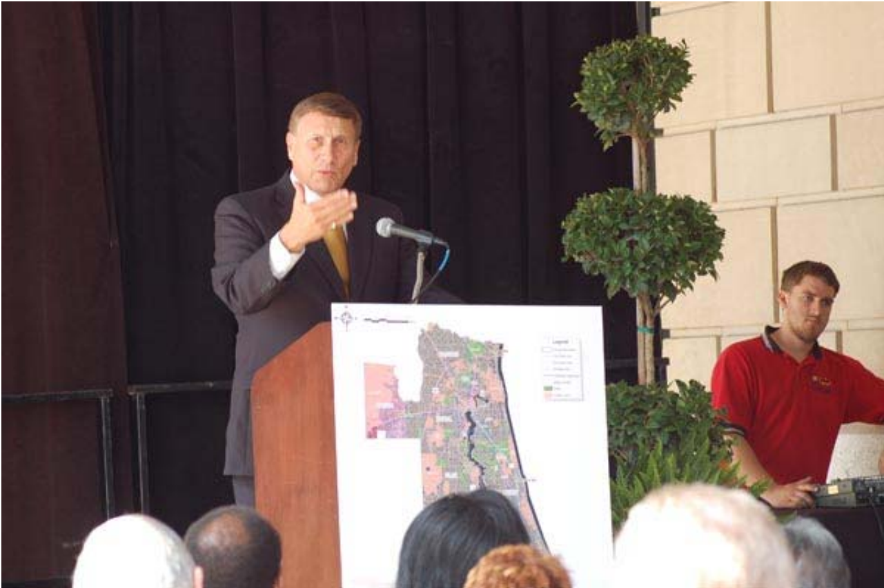
Congressman John Mica, prepared with a map of the region, spoke about the positive impact commuter rail would have on the quality of life in Jacksonville.