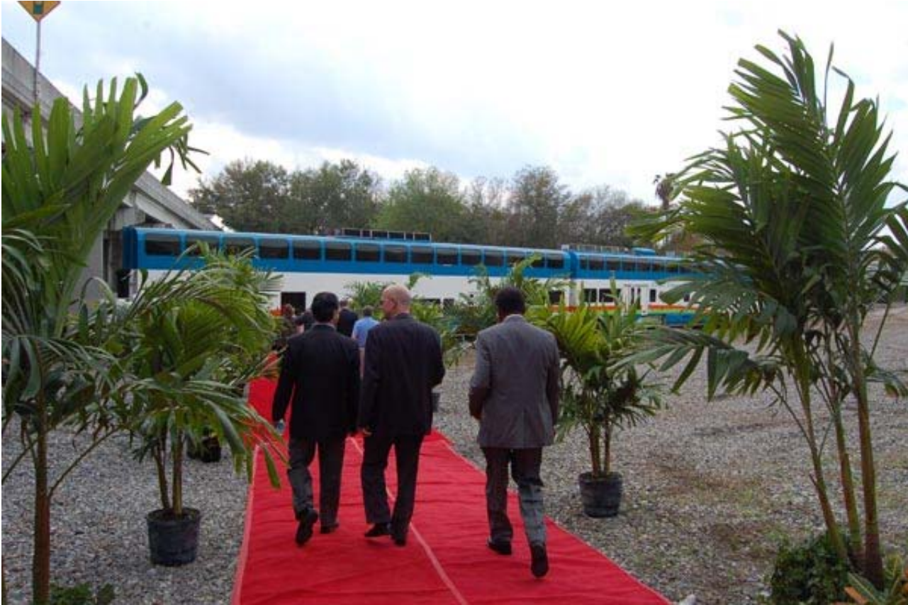
Previously serving as a homeless camp/garbage dump, this area, located along the railroad tracks and under an overpass, was cleaned up for the event. Commuter rail is already transforming the city.