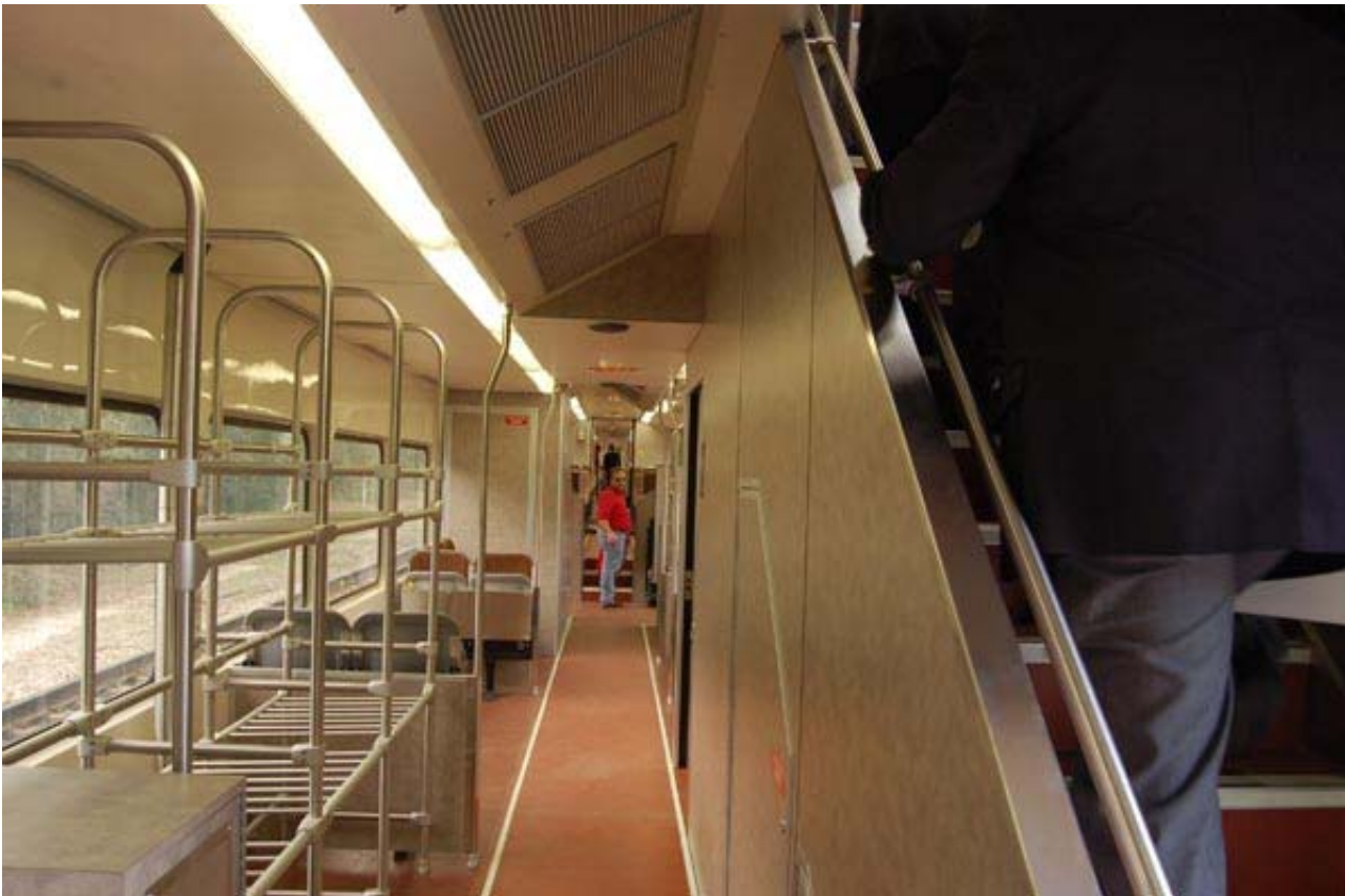
After boarding the train, there is a staircase to go up and a hallway that takes you past luggage racks to seating on the lower level.