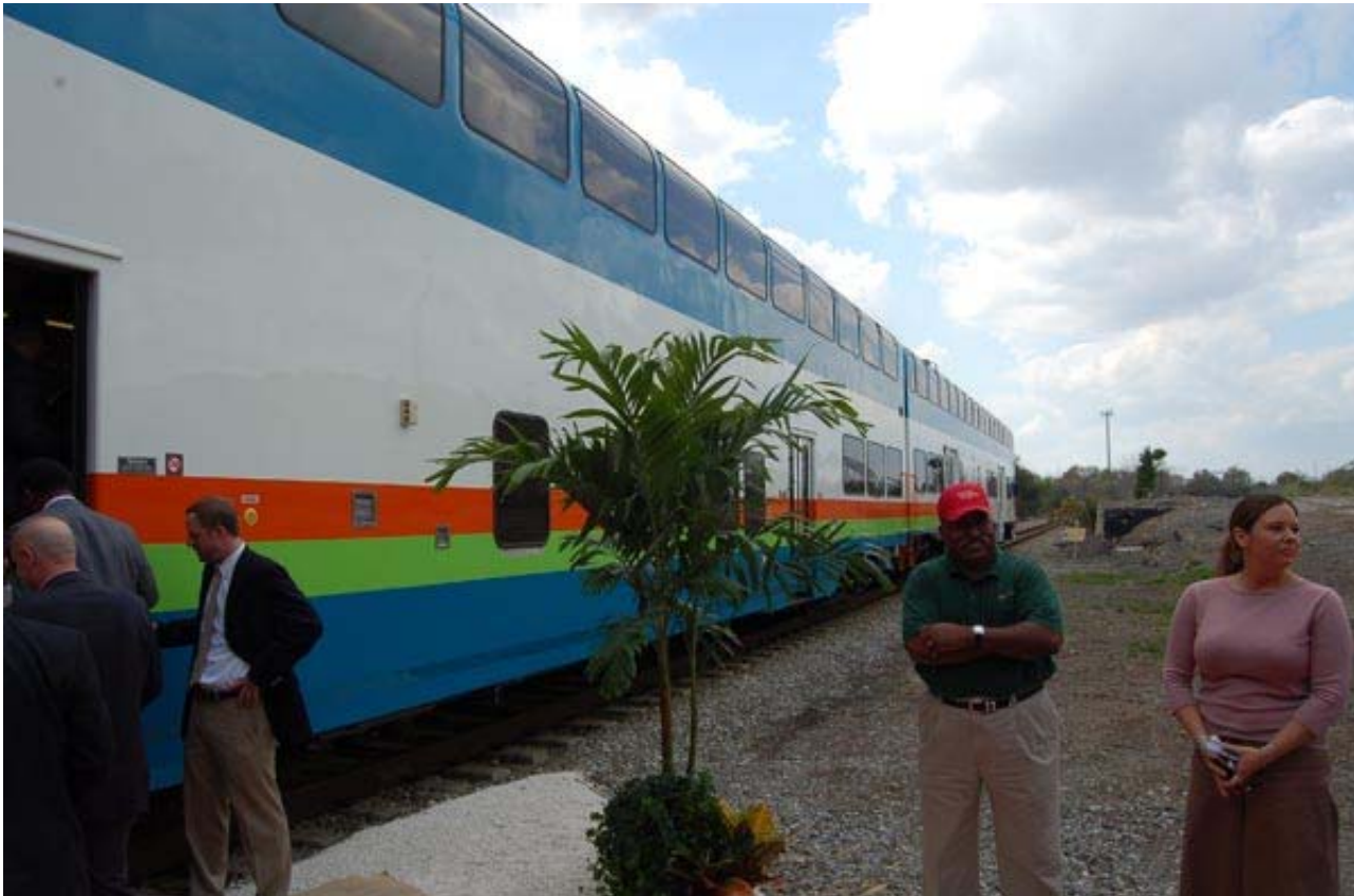
Boarding the train. These bi-level railcars are 20 feet tall, over twice the height of a typical city bus.