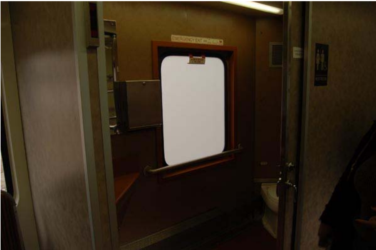
Large handicap accessible bathrooms.