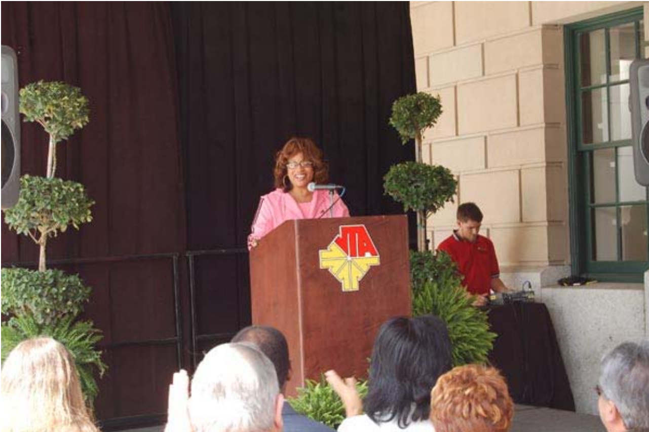
Congresswoman Corrine Brown, happy to be back in Florida after a cold trip to Washington D.C.