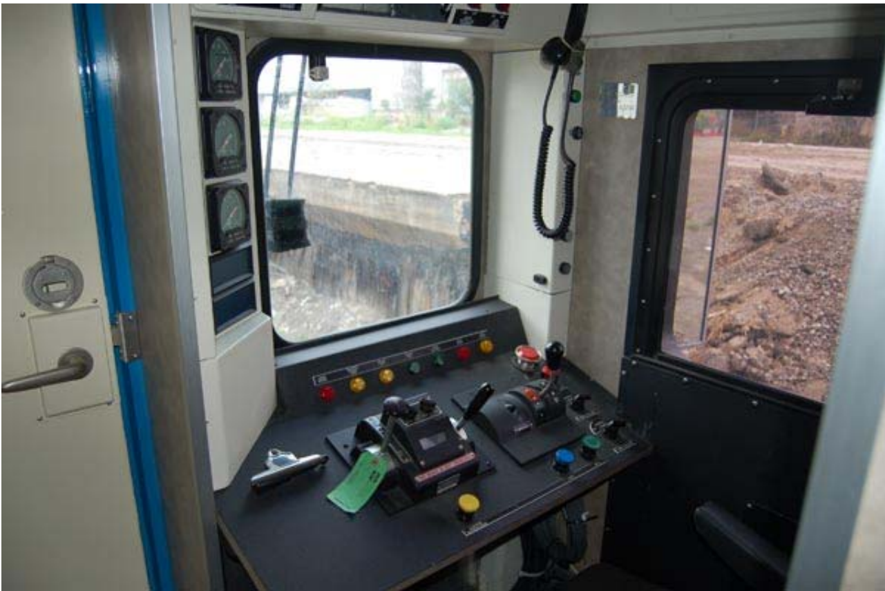
Cab of the lead unit. The engines are onboard, allowing the railcars to operate without a locomotive.