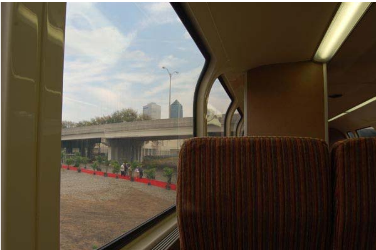
Impressive view from the upper level.