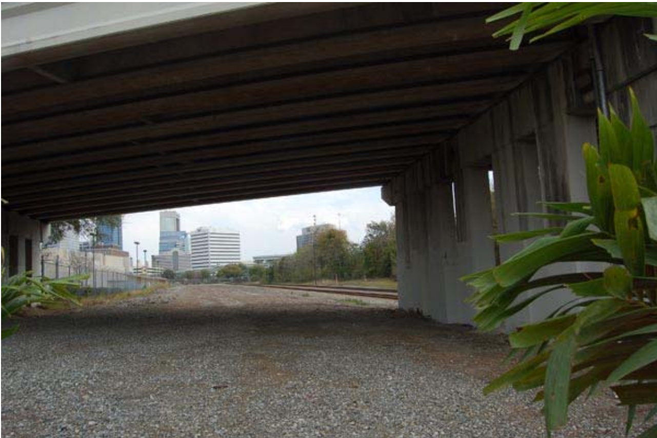
The Right-of-Way is extremely wide outside the Prime Osborne Convention Center. This area previously had railroad tracks, and could easily accommodate them once again.